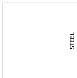
POWDER COATED STEEL