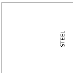
POWDER COATED STEEL