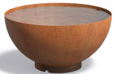
WATER BOWL BOCCA