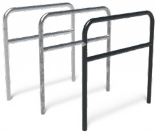
AROS 2S WITH TILT BAR