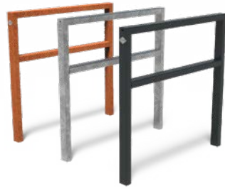
AROS 1S WITH TILT BAR